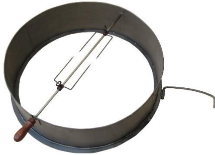
Rotisserie Drum, Spit & Two Forks

Thank you for purchasing the Kadai Rotisserie, complete with Rotisserie Drum, Half Grill, Spit & Two Forks. (Please note the Rotisserie is only compatible with the Gothic High Stand)