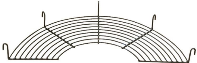
Rotisserie Half Grill